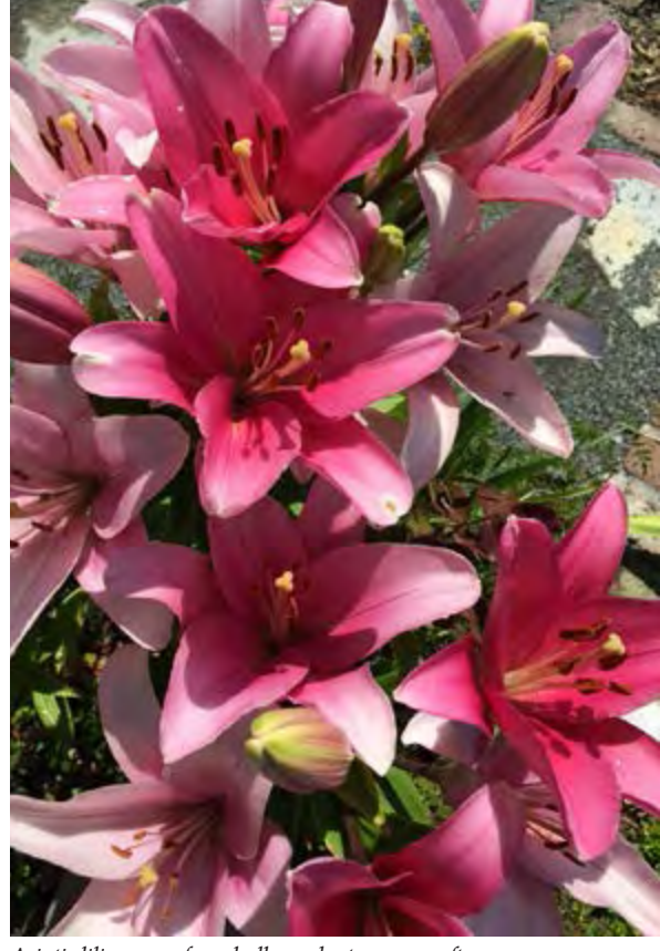
Asiatic lilies grow from bulbs and return year after year.

Here are a few of my favorite recommendations for adding sparkle, individuality and excitement without the extra water and work this season.